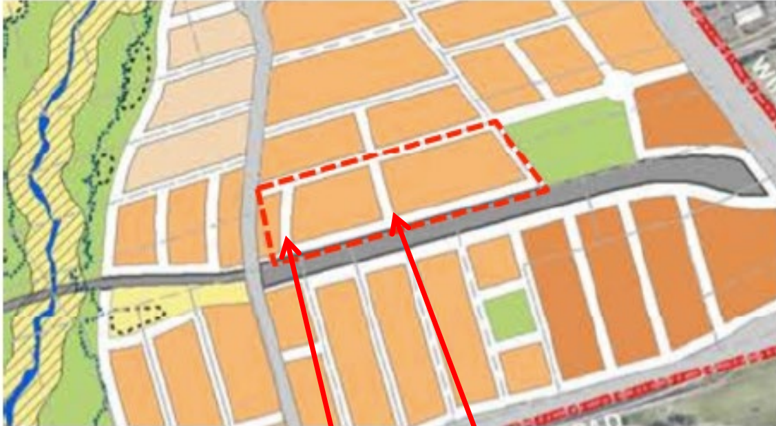
Figure 12 – Area 20 Precinct ILP